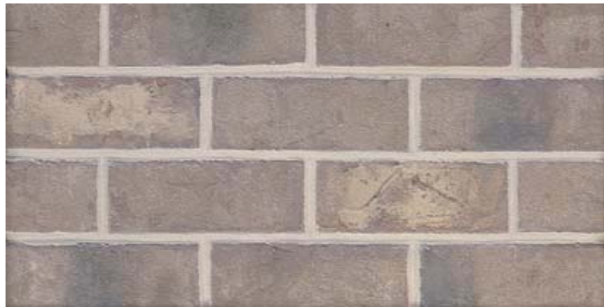
MILLSTONE OVERSIZE BY: PINEHALL BRICK Location: Columns and Walls for Street Elements