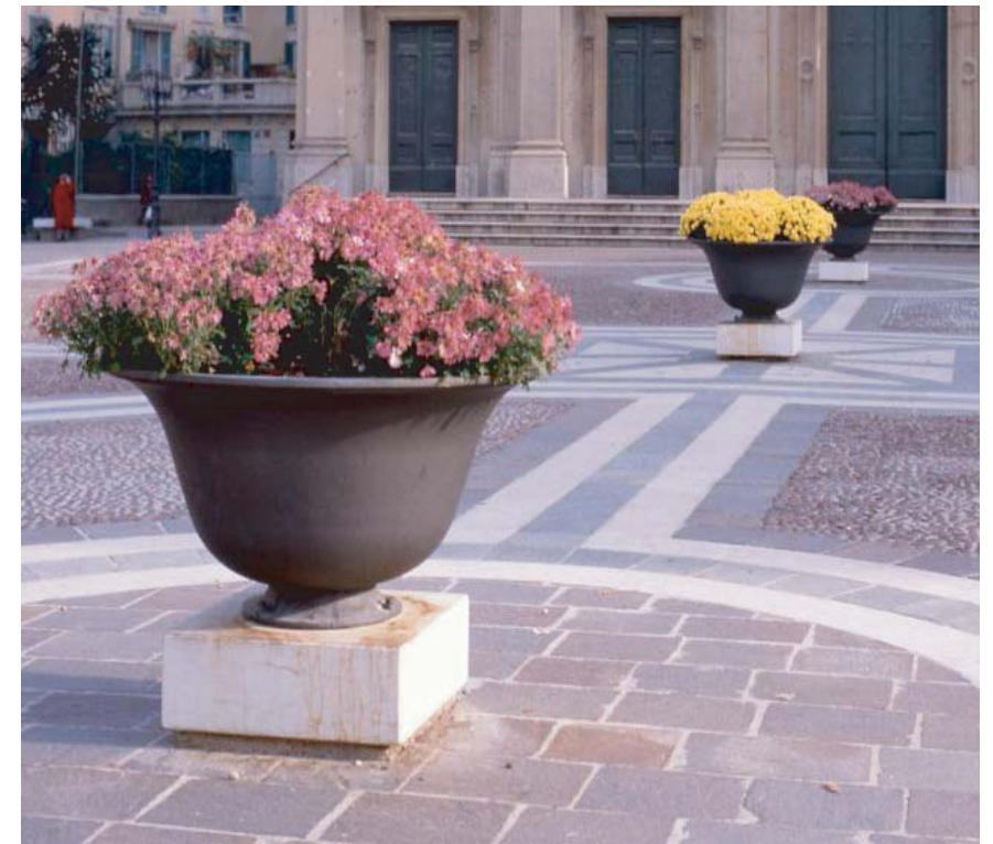
PLANTER 2204 BY: NERI