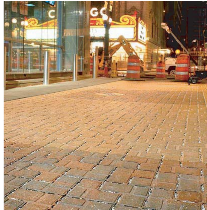
ECO-OPTILOC BY: UNILOCK Optional Site Item Location: Parking Stalls Color: To Be Determined