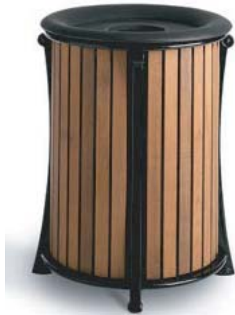
PLAINWELL WOOD TRASH CAN BY: LANDSCAPE FORMS