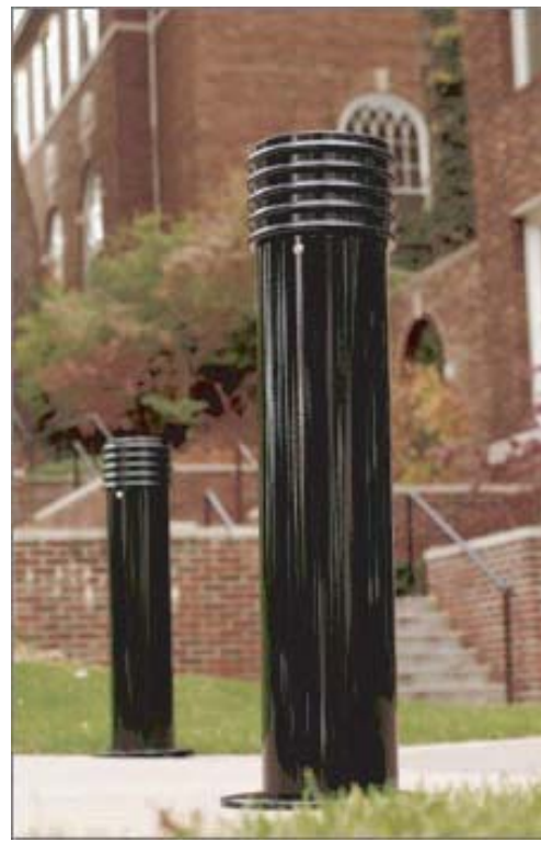
ANNAPOLIS BY: LANDSCAPE FORMS Location: Paver Nodes