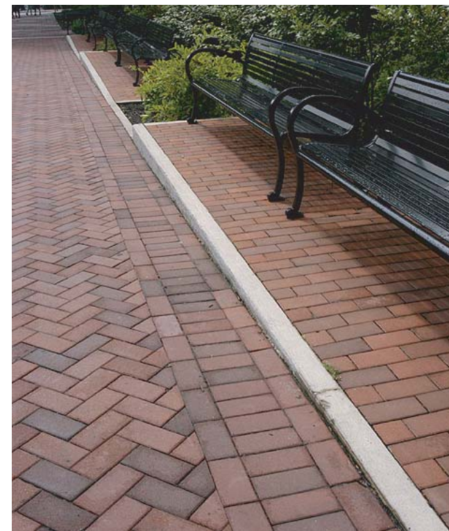
OLD WORLD COBBLED BY: WHITACRE GREER Location: Banding Color: To Be Determined