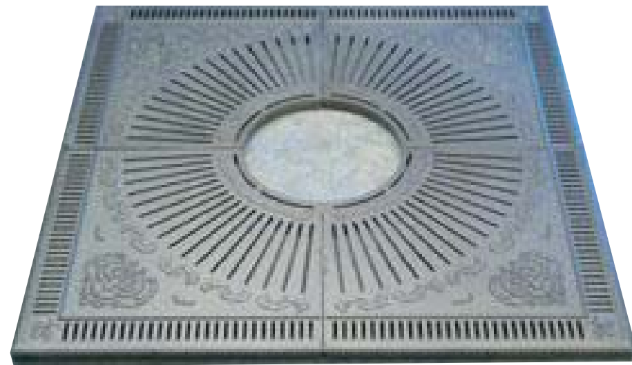
CHELSEA TREE GRATE BY: EAST JORDAN IRON WORKS