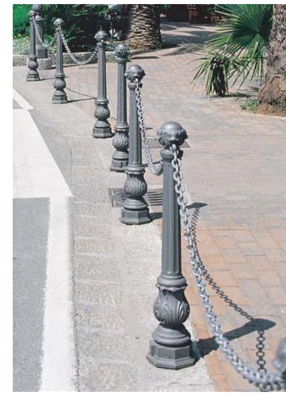
2983 BY: NERI Location: Paver Nodes