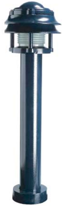
CANDB2 BY: LUMEC Location: Paver Nodes