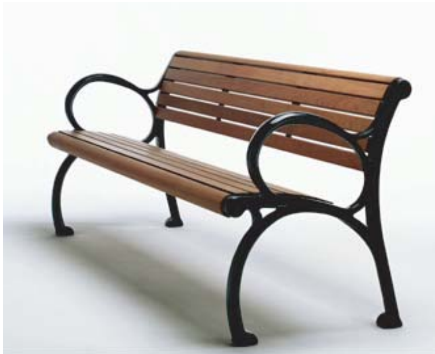
PLAINWELL WOOD BENCH BY: LANDSCAPE FORMS