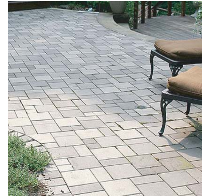
50 SERIES CLAY PAVERS BY: WHITACRE GREER Location: Paver Nodes Color: To Be Determined